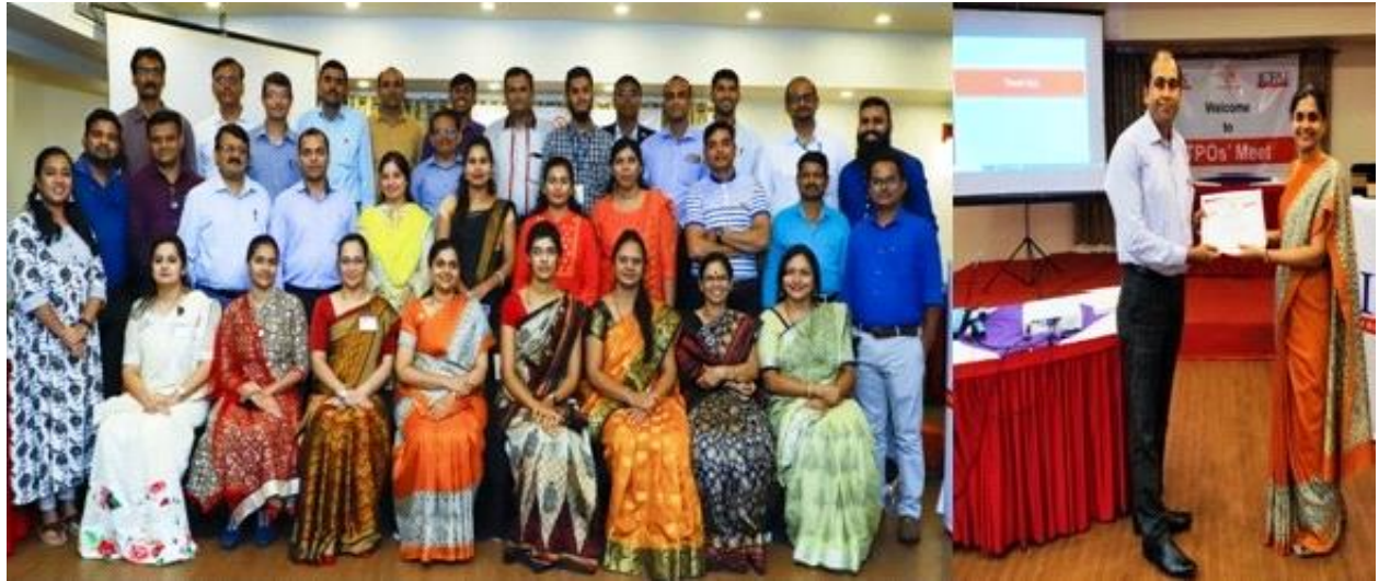
ICFAI Business School Nagpur" conducted workshop on "TPO 360°- Opportunities and Challenges.